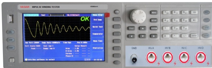
Multi Channel Impulse Winding Tester