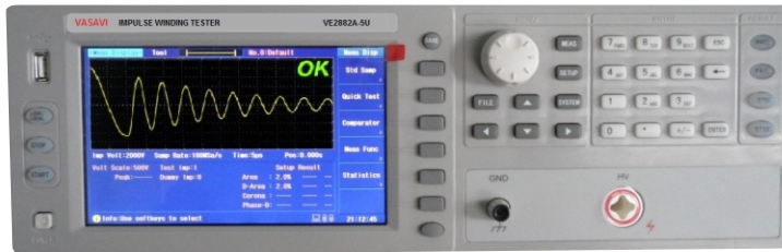
Single Channel Impulse Winding Tester